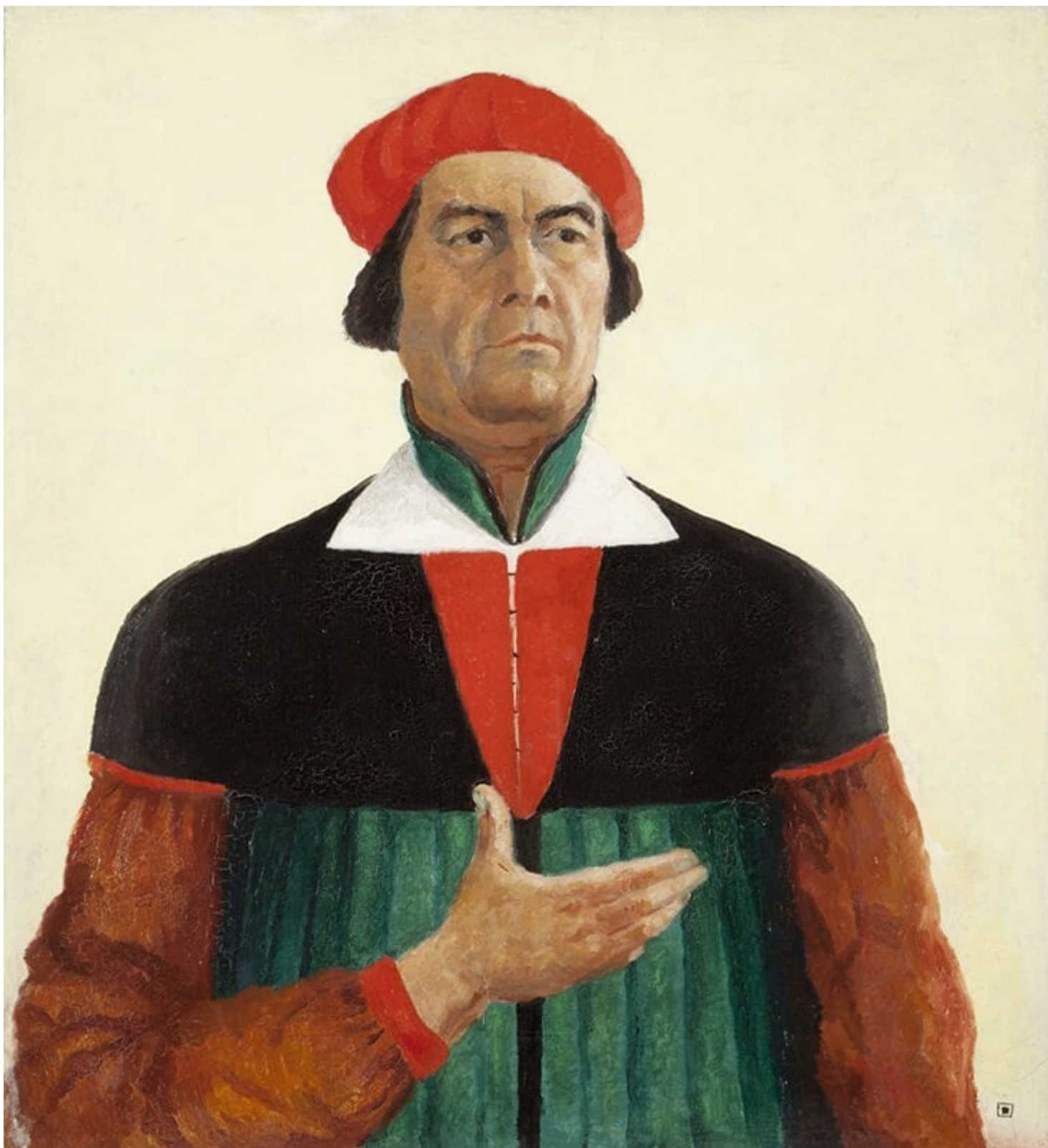
Self Portrait / Kazimir Malevich / 1933 / State Russian Museum, St. Petersburg