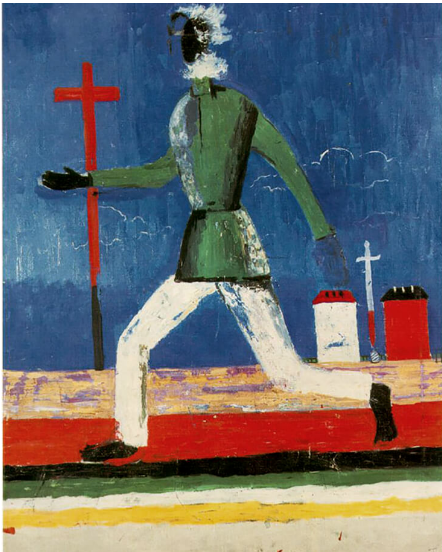
Running Man / Kazimir Malevich / 1932-34 / Musee National d'Art Moderne,