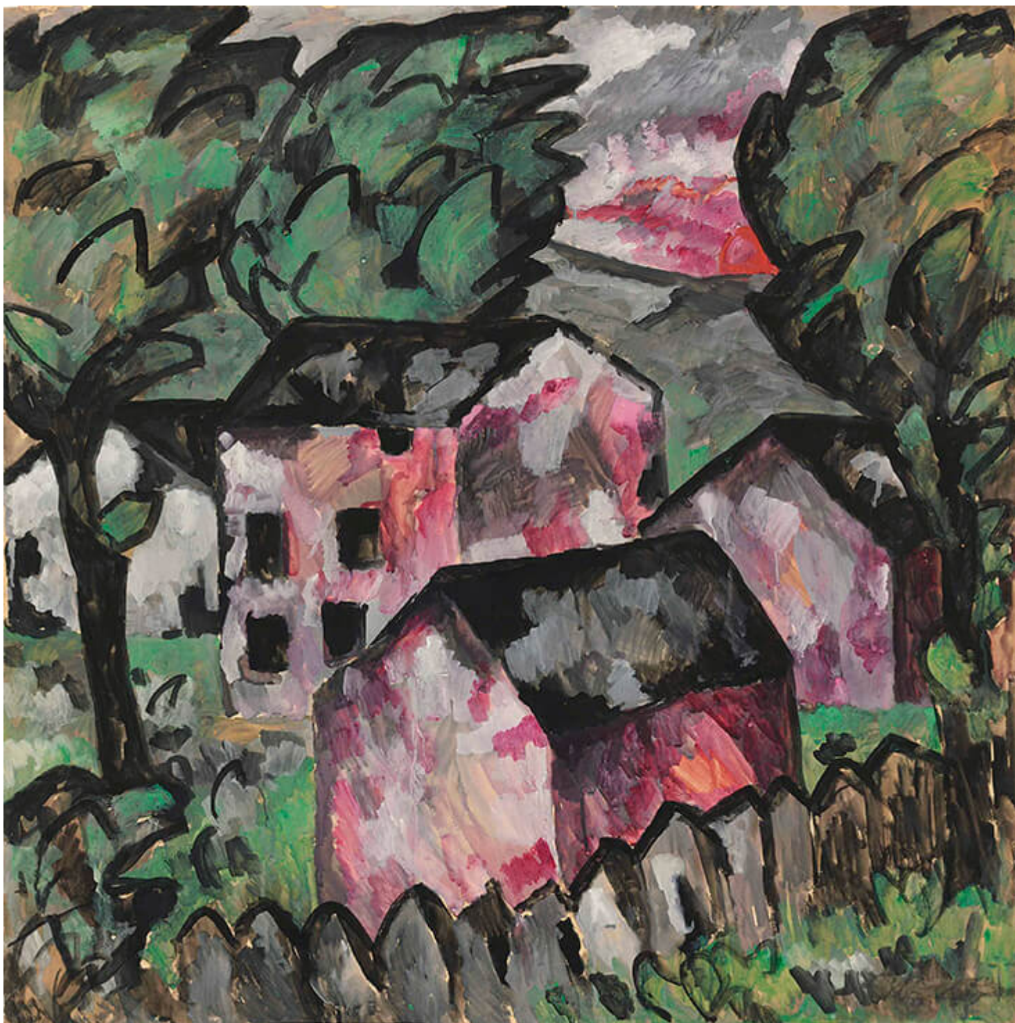
Landscape / Kazimir Malevich / 1911

MALACHITE Linen's earthy, rustic green was a favourite with Russian artist Kazimir Malevich, investing his paintings with the lush, juicy vibrancy of fertile nature. A giant of 20th century art, Malevich made his name as the